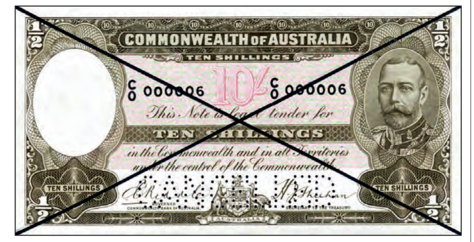
10 Shilling 1933 Specimen Sold for $38,160.