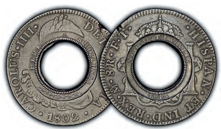
The Superb Roth Holey Dollar Sold for $181,260.

the superb Roth Family Holey Dollar 1813, a high grade example in aEF condition with countermarks virtually as struck, and an impressive provenance. This important colonial coin sold after two bidders battled it out for $181,260.