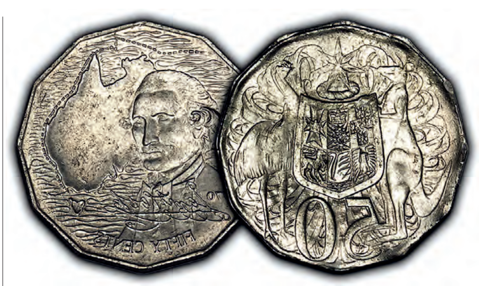
Two Superb 50 Cent Brockage Mis Strikes Sold for $11,805 and $5,366 respectively.

sets from 1887 and 1902 both realised $9,063,