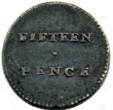
A gVF 1813 Dump Sold for $23,850