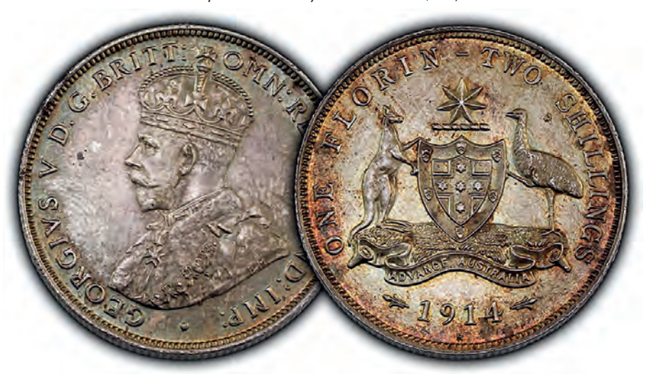
The Birmingham Mint Museum 1914H Specimen Proof Florin Sold for $76,320.