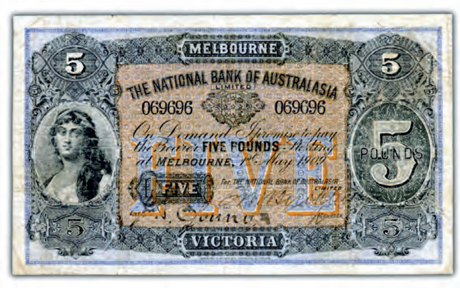
A Rare Signed 5 Pound National Bank Of Australia Sold for $13,236.

The rare Taylor Pattern gold Shilling, estimated at $280,000, was sold via private treaty before the sale.