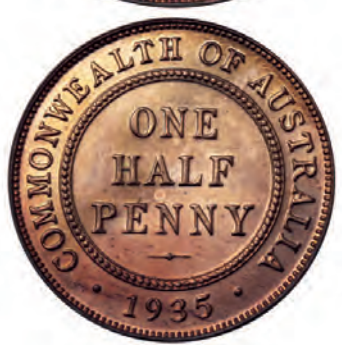
This Superb 1935 Proof Halfpenny and Penny Pair Sold for $23,850.