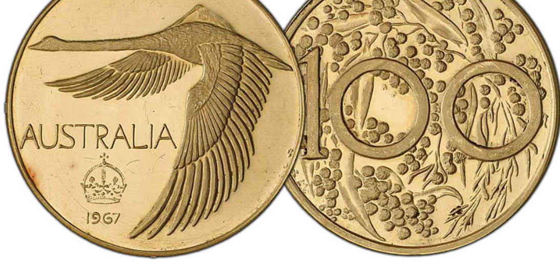
A highly sought after rarity – the original 1967 Pattern Gold Swan Dollar

Pre Decimal Specimen Banknotes are all extremely rare, with only a handful of most issues in existence. To have four different notes all in the one sale is truly extraordinary, especially at the sort of prices they have been listed for sale at!