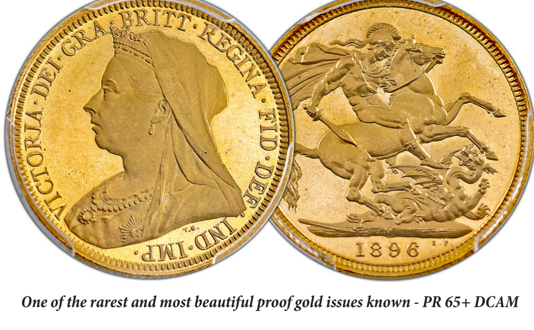
One of the rarest and most beautiful proof gold issues known - PR 65+ DCAM

Key early Pre-Decimal banknotes feature, with high grade examples of the 'square' 10, 20, and 50 Pounds. The 20 and 50 Pounds both have the impressive pedigree of ex the M.P. Vort-Ronald collection plate notes and feature in many articles.