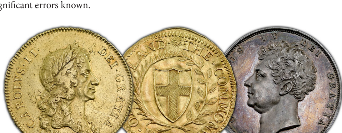
Key rare British coins featuring many superb highlight rarities

Signature Sale 100 features perhaps the largest and single most important collection of Australian Mis-struck error coinage known. The 'Eridmatos' collection, carefully curated over the last 12 years, comprises some of the most significant errors known.