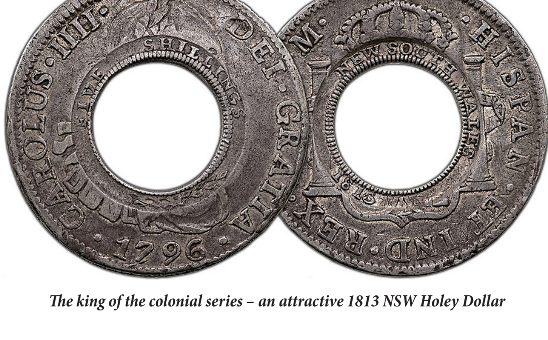
The king of the colonial series – an attractive 1813 NSW Holey Dollar