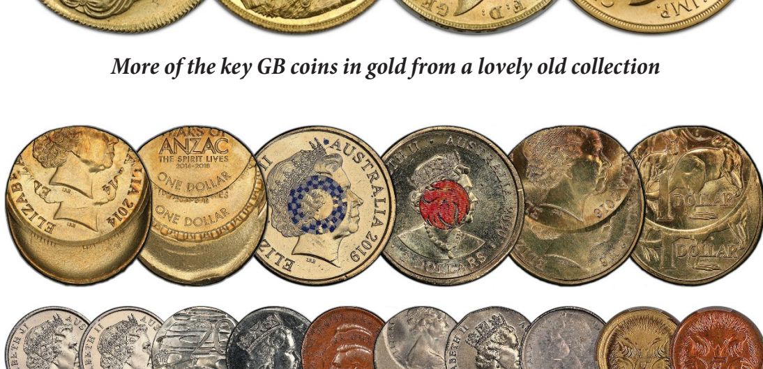
More decimal error highlights from the amazing Eridmatos Collection

Highlights of this important collection include two 1988 Mule 50 Cents; a Proof and a circulation issue along with a 20 Cent struck on a bi-metallic Iranian 250 Rials blank. Other rare and unique issues include many struck on a variety of wrong planchets, double heads/tails, multiple and off center strikes, coloration errors and more!