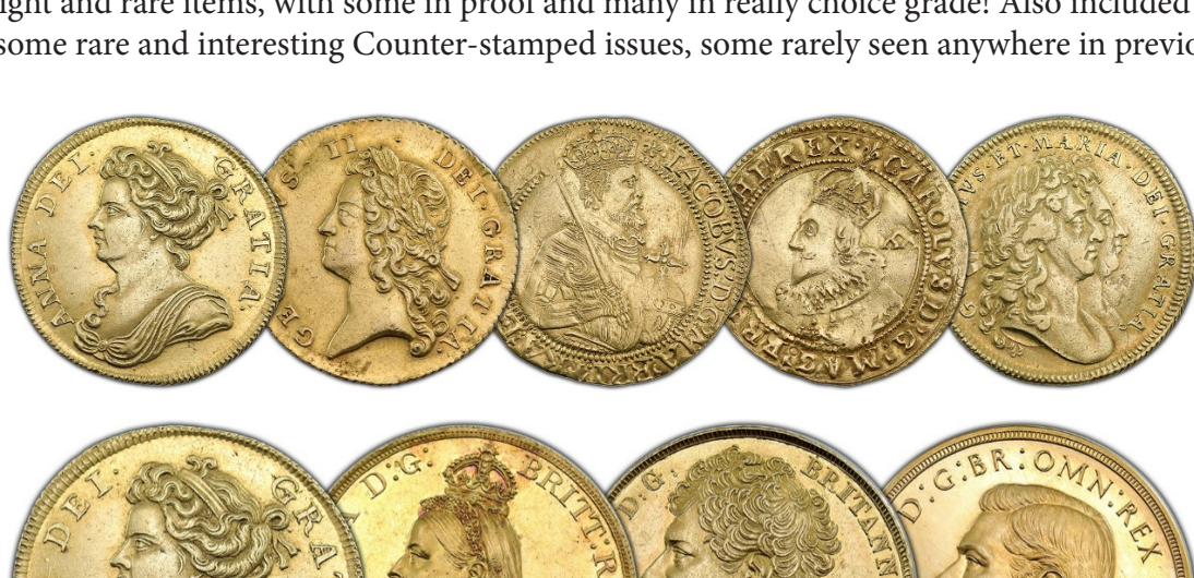
More of the key GB coins in gold from a lovely old collection

Another significant feature in Sale 100 is an old Type collection of GB and Proclamation coinage featuring many highlight and rare items, with some in proof and many in really choice grade! Also included in this collection are some rare and interesting Counter-stamped issues, some rarely seen anywhere in previous years.