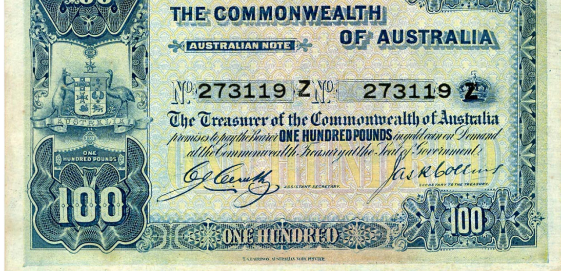
A Superb high grade example of the iconic 100 Pound Banknote

A key highlight going under the hammer in Sale 100 is a collection of colonial rarities featuring a superb NSW 1813 Holey Dollar on a Mexico 8 Reales 1796FM.