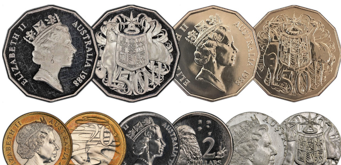
A few key decimal errors from the amazing 'Eridmatos' Collection

IAG has now offered two of these highly sought after gold patterns in the last year, giving those that missed out last time another chance to obtain this 'Unicorn' issue.