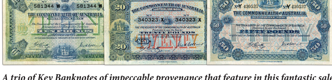
A trio of Key Banknotes of impeccable provenance that feature in this fantastic sale

Early gold proofs are extremely hard to find, with Sydney Mint issues a virtual impossibility to obtain! This rare gold coin is ex the Pretoria Mint South Africa Collection. A beautiful cameo proof example and highly important as such.