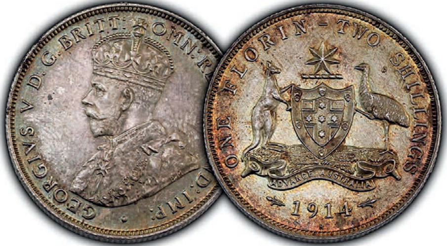
The Birmingham Mint Museum 1914H Specimen Proof Florin