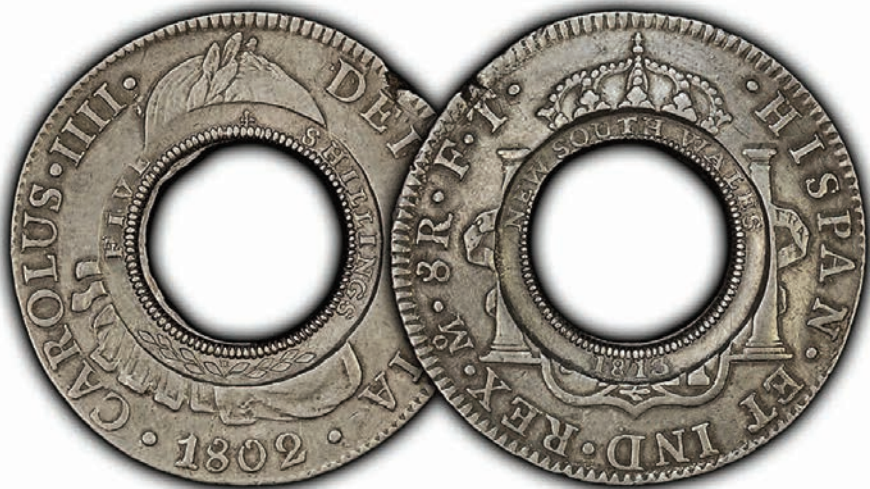
The Roth Holey Dollar. Estimated at $210,000.

Coin highlights include a comprehensive selection of Pre Decimal coinage, comprising both proof and circulation issues in high grade. A few highlights in proof include a PCGS graded Shilling 1934 PR 66, a 1935 Penny and Halfpenny pair PR 64RB, a 1939 Roo Halfpenny, a 1938 Halfpenny and a 1928, 1935 and 1938 Penny. This is along with three 1930 Pennies in assorted grades priced from $6,000 upwards, along with a VF 1813 Dump