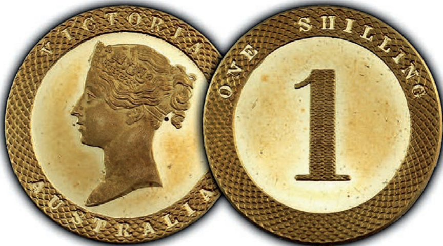
Taylor Pattern Gold Shilling, Estimated at $280,000