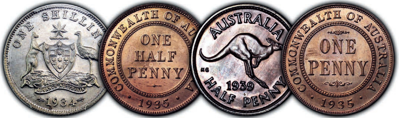
A few of the choice Pre Decimal Proofs to be offered at IAG's Sale 85.

and a large quantity of Choice and Gem grade coins, many PCGS graded including many rare issues.