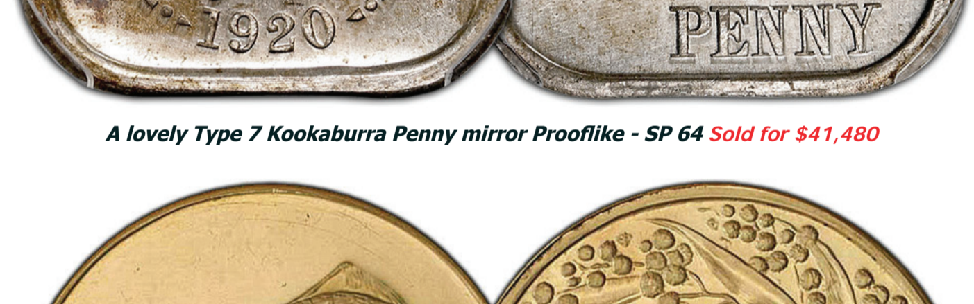
A highly sought after original 1967 Pattern Gold Swan Dollar Sold for $38,430

IGAG has now offered two of these highly sought after gold patterns in the last year, with the astute buyer taking this lucky second chance to obtain this 'Unicorn' issue.