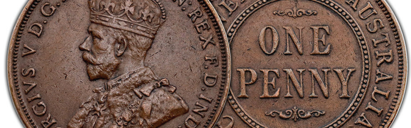
A superior high grade gVF/aEF 1930 Penny with strong band Sold for $56,120

A more beautiful proof gold example would be hard to find, with a lovely frosty portrait and flawless mirror fields - ideal for any serious rarity proof collectors.