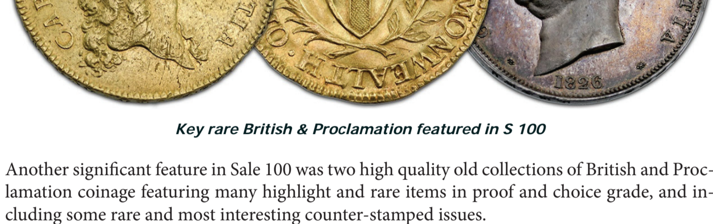
The GB and Proclamation coins from two old collections Sold for over $220,000

Another significant feature in Sale 100 was two high quality old collections of British and Proclamation coinage featuring many highlight and rare items in proof and choice grade, and including some rare and most interesting counter-stamped issues.