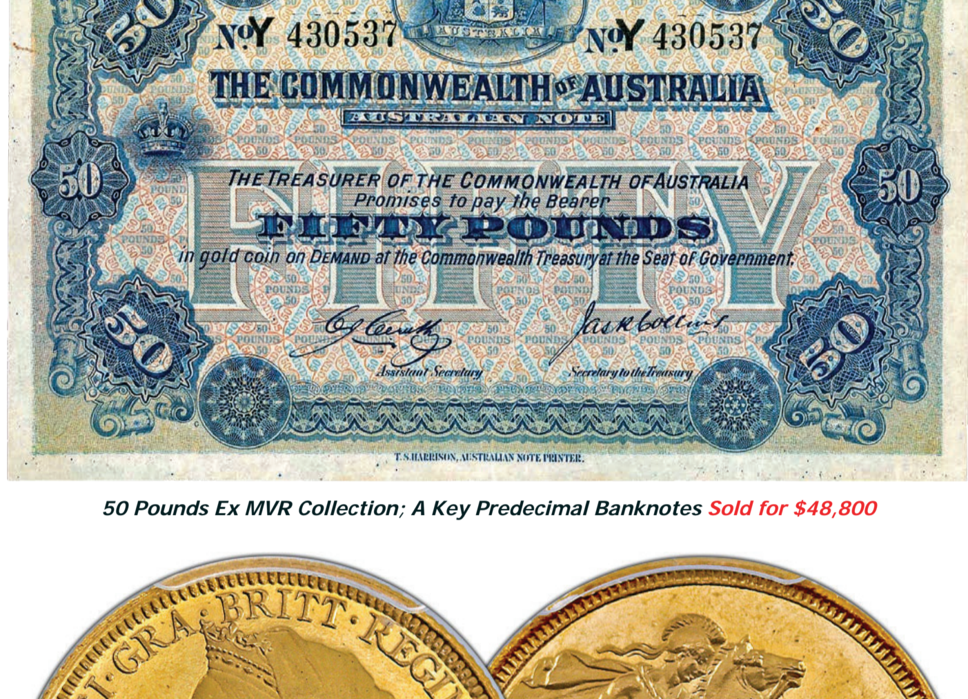
50 Pounds Ex MVR Collection: A Key Predecimal Banknotes Sold for $48,800

Early gold proofs are extremely hard to find, with Sydney Mint issues a virtual impossibility to obtain! This rare gold coin was ex the Pretoria Mint South Africa Collection. A beautiful cameo proof example and highly important as such.