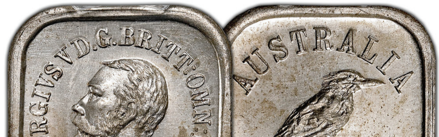
A lovely Type 7 Kookaburra Penny mirror Prooflike - SP 64 Sold for $41,480