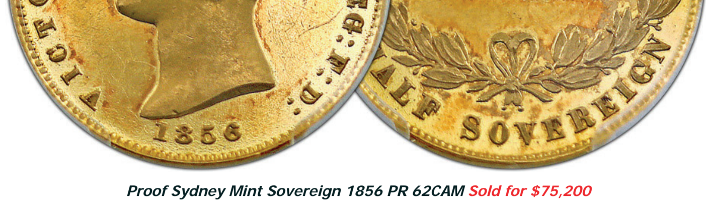
Proof Sydney Mint Sovereign 1856 PR 62CAM Sold for $75,200

A superior grade 100 Pound in gVF/aEF and probably the second or third finest known. A key high denomination banknote issue for the Pre Decimal series.