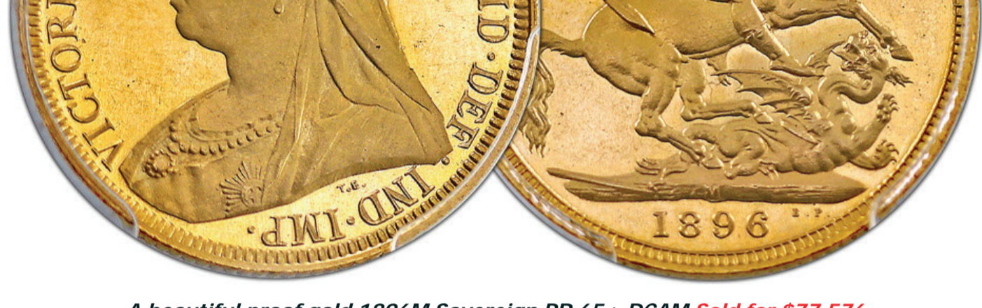
A beautiful proof gold 1896M Sovereign PR 65+ DCAM Sold for $77,576

A more beautiful proof gold example would be hard to find, with a lovely frosty portrait and flawless mirror fields - ideal for any serious rarity proof collectors.