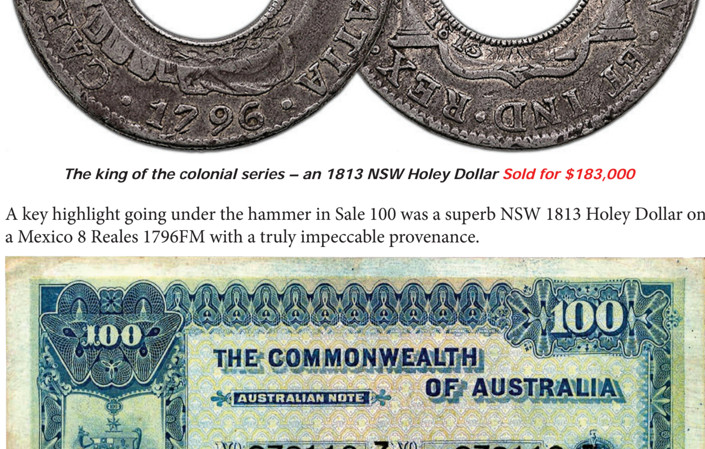
The king of the colonial series – an 1813 NSW Holey Dollar Sold for $183,000

Vendors were left smiling as final realisations came in at an average of almost 30% over reserves, whilst buyers were stunned with the amazing selection of high quality material available in the one sale.