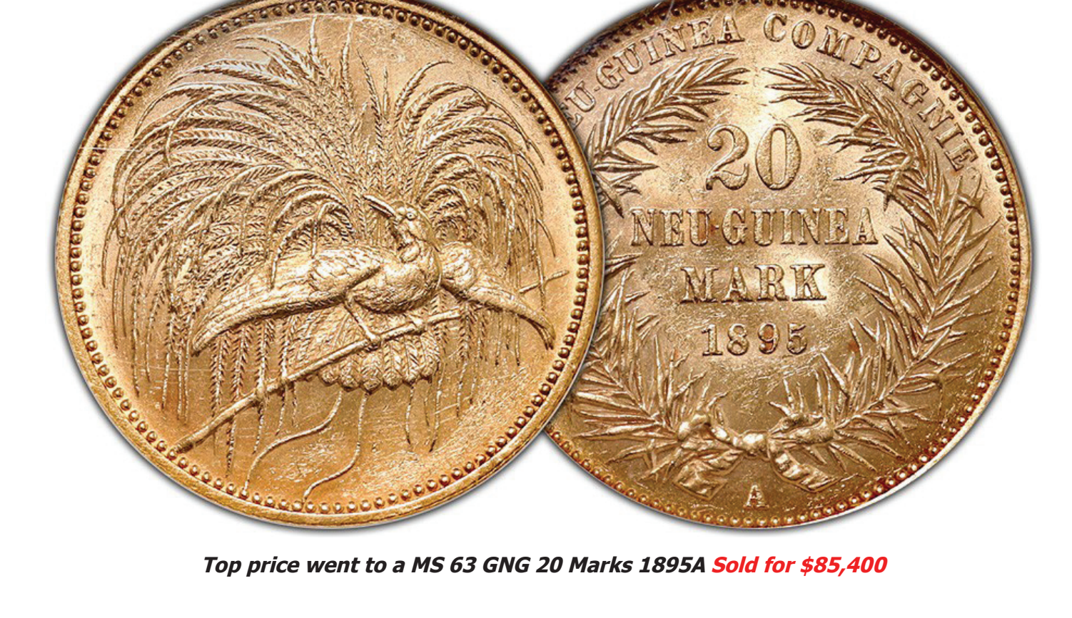
One of the most famous world gold issues is the German New Guinea 20 Marks 1895A. A NGC grade of MS 63 places this globally significant numismatic rarity as amongst the finest

than 1,000 Members logging in to view and bid in the first week. Final auction realizations were over $1.35 million from only 1800 lots, with a high final clearance rate of over 89%!