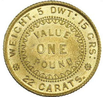
Finest Known 1852 Type II Adelaide Pound Estimated at $325,000