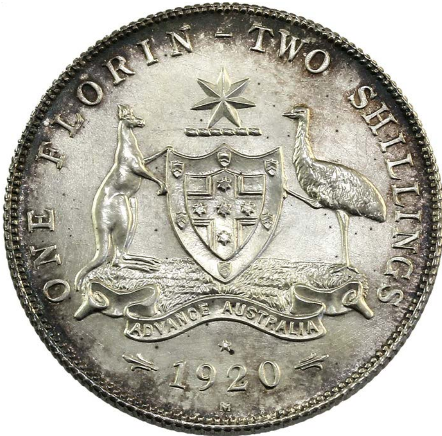
1920 Specimen Star Florin Estimated at $80,000

Alongside these is an aUnc 1852 Adelaide Pound Type I, estimated at $100,000 - a keen price for this major rarity that is amongst the finest known of this type, a significant Colonial rarity in an attractive 1796 Holey Dollar in gVF grade (estimated at $140,000) along with the finest known Type II Adelaide Pound, estimated at $325,000. These