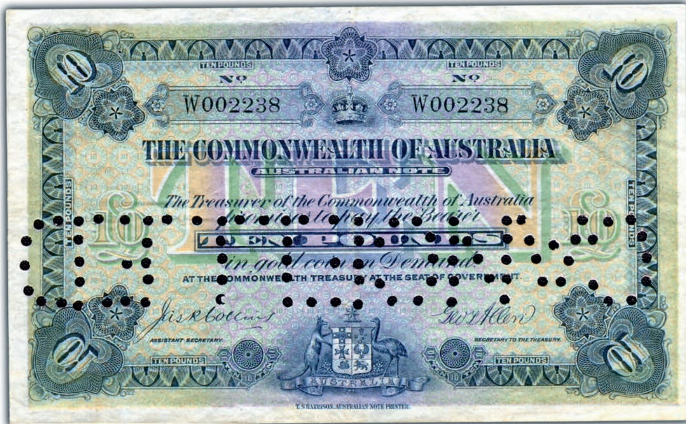
10 Pound 1913 Specimen. Estimate $65,000.

IAG's next major Signature Auction - Sale 91 - to be held in March 2020, will be their 35 th Anniversary Auction Spectacular! With an amazing selection of some of the rarest Coins and Banknotes offered in many years, this Anniversary Sale is one that will be sure to be remembered for many years- and maybe for another 35 years!