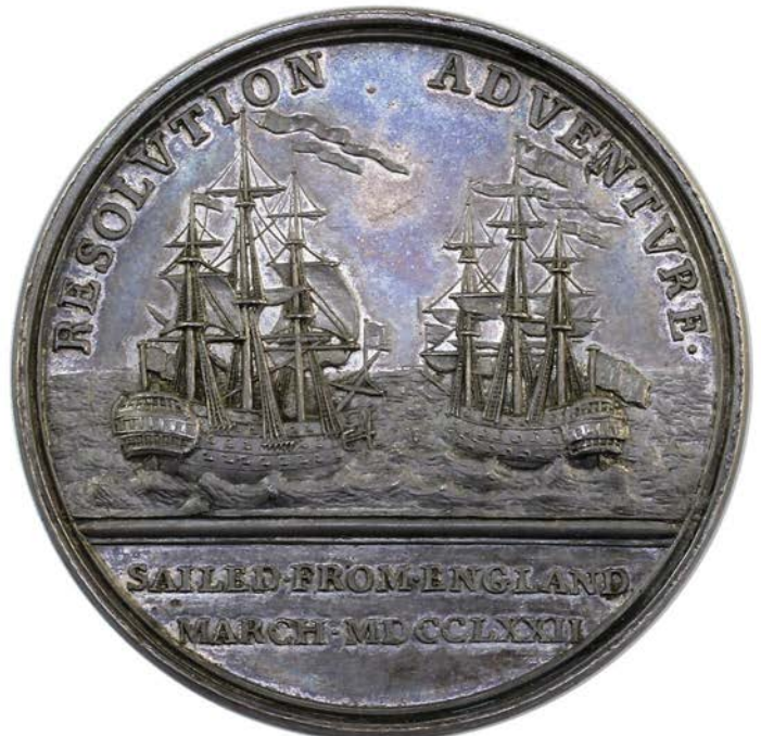
Resolution and Adventure Medal struck in Silver Est $12,000