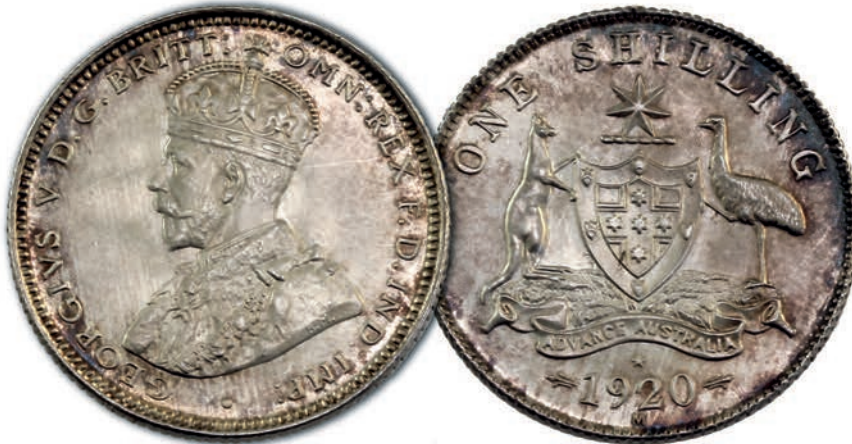
1920 Specimen Star Shilling. Estimate $80,000.