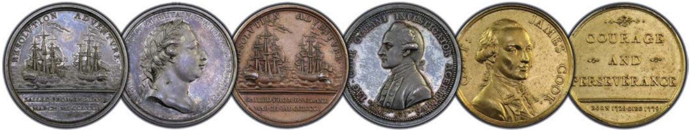
A Rare collection of Captain Cook Exploration Medals

five coins underpin a stunning selection of major rarities!