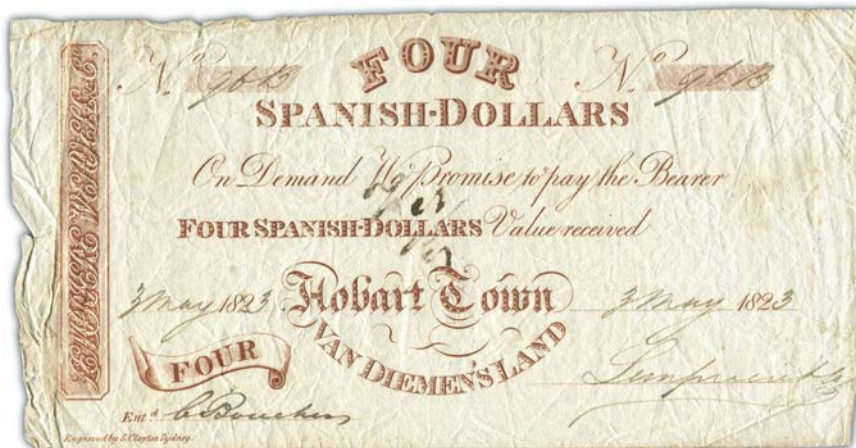
Spanish Four Dollars_ Est $9,000]

The Catalogue for Sale 91 can be downloaded and viewed for free on IAG's website, and every lot image can be viewed online. Posted hard copies of the catalogue are also available via subscription from IAG now. Join up online today to receive further information, view and place bids online. Go to www.iagauctions.com for this, along with other auction information, previous catalogues, prices realised and more, or contact IAG direct by- Phone (07) 55 380 300 – or by Email mail@iagauctions.com with any queries.