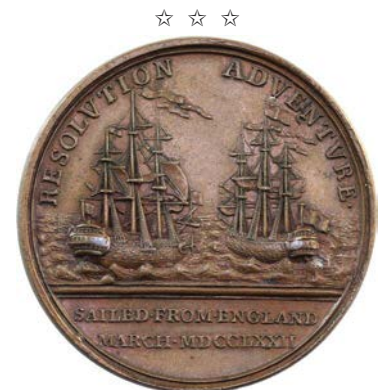
Resolution and Adventure Copper. Estimated at $10,000.