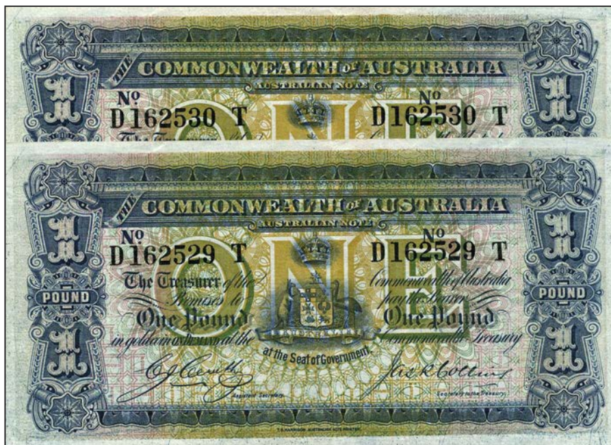
Pair of Pounds 1918. Estimated at $14,000