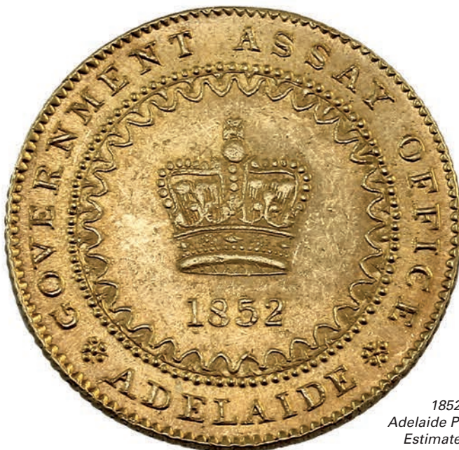
1852 Type I Adelaide Pound aUNC - Estimate $100,000.