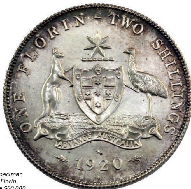
1920 Specimen Star Florin. Estimate $80,000