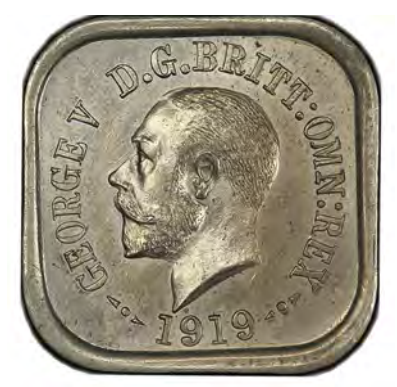
A Kookaburra Penny Type 3 in SP 64 sold post sale for $34,648.

uncontested or slow to sell. Banknotes in general in this sale, from Pre Federat-ion to Decimal, all experienced strong bidding. For example, the unique 10 Pound 1913 Specimen was knocked down for $73,200.