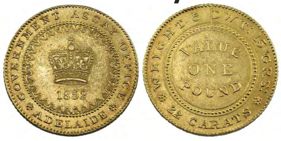
1852 Adelaide Pound Type I. Sold for $176,900

DESPITE the arrival of the Covid-19 virus forcing IAG to transition this sale to Live Online, Sale 91 was a record breaking sale! It was a celebration of IAG's 35 Years and counting of live and online auctions.