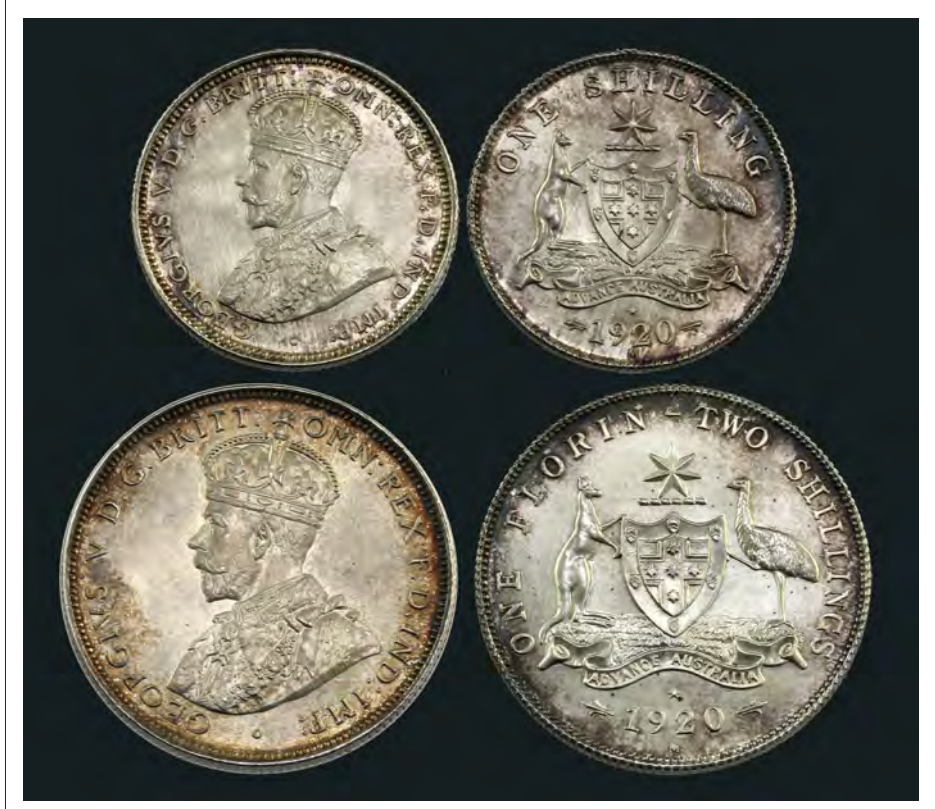
An extremely rare pair of Pattern 1920 Star Shilling and Florins sold for a combined total of $158,600.