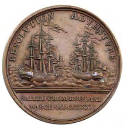
Two Captain Cook Exploration medals, sold for $19,520 for the pair.