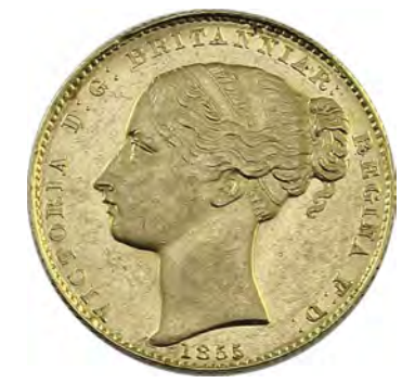
The 1855 Sydney Mint Sovereign that realised $14,640

trial note finally sold after 30 bids from four different bidders for an impressive $79,300. It was great to see four people all chasing the same note, a far cry from previous years and auctions where expensive banknotes have often been