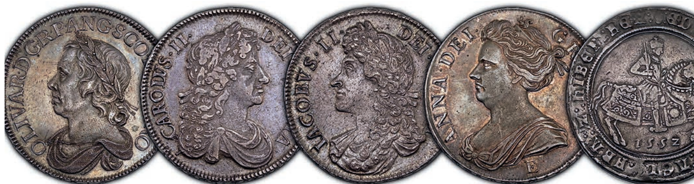
Just part of the Superb British Crown Collection.

Other items of note so far catalogued include a Type 1 Adelaide Pound in MS 61, two Type II Adelaide Pounds, a Type 3 and Type 12 Kookaburra Penny, a number of Pre Decimal Proof coins including a 1916 Halfpenny, a 1947Y and 1948Y Penny, a Proof 1937 Crown and a 1934 set all FDC, all along with two 1930 Pennies, a Dump in gVF, a Specimen