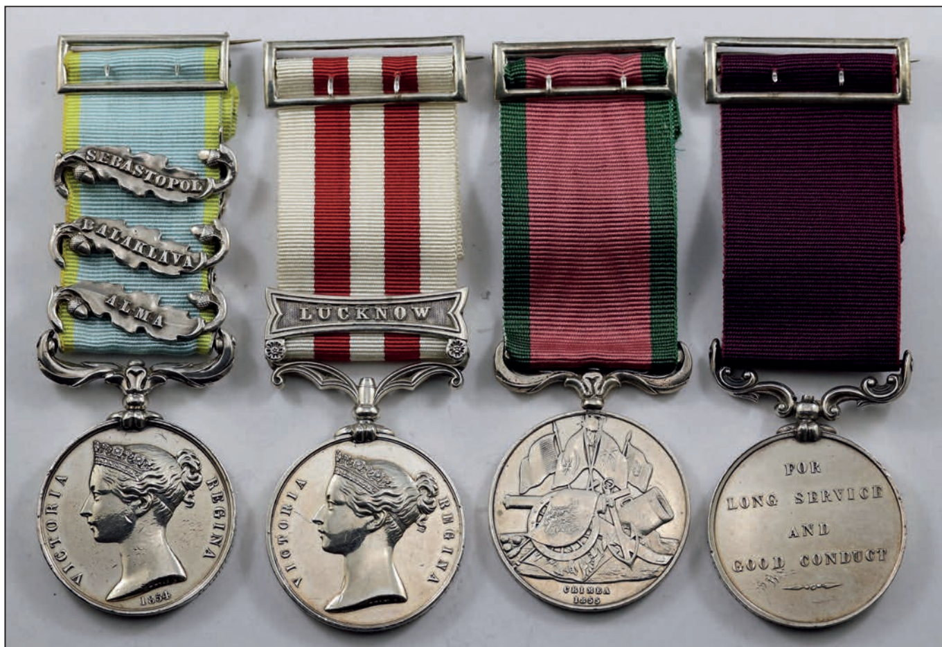
Sale 94 includes a number of Rare Medal groups.

LAG's next major Signature Auction, Sale 94 - to be held in mid September 2021 - will perhaps be the best and most important auction they have run in the last 10 years! Covid restrictions have again played havoc with several key consignments currently stuck interstate, however the quality and depth of material already received for this auction is truly breathtaking.