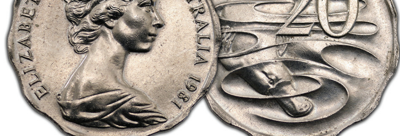
A Key decimal Error issue - a 20 Cent struck on a Hong Kong blank

Error coins include perhaps the key decimal error - a scalloped 20 Cent 1981 struck on a Hong Kong blank. This rare and striking error is always in high demand, and with only a handful known, is sure to be eagerly sought after!