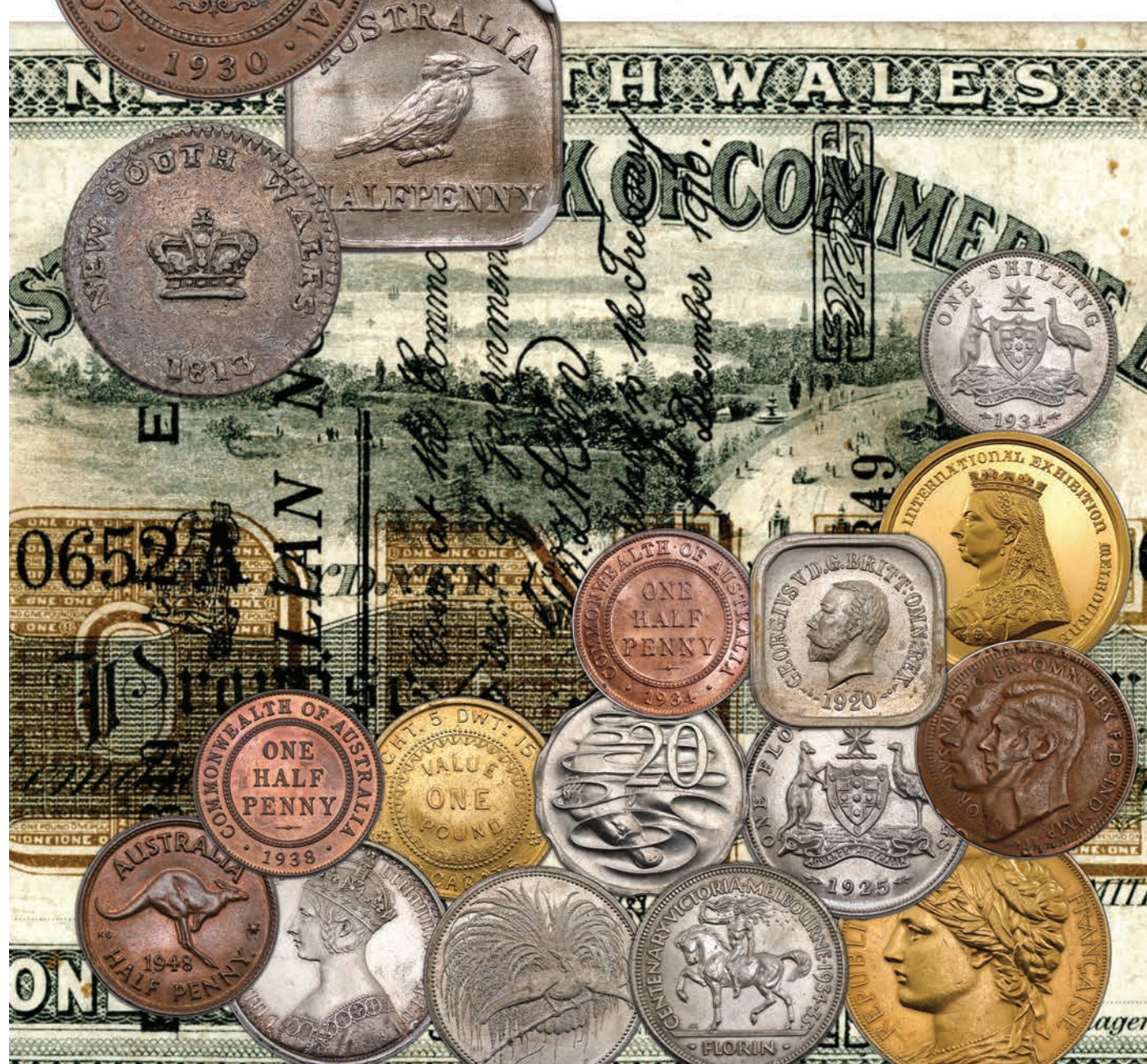
Sale 99 will be online and open for bidding from the 20th February 2024

Tuesday 12th, Wednesday 13th and Thursday 14th March 2024