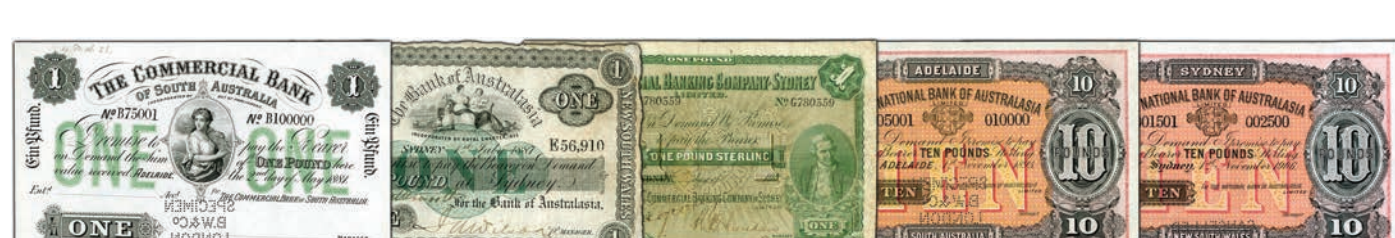
A nice selection of Pre Federation Banknotes including a number of Specimens

Error coins include perhaps the key decimal error - a scalloped 20 Cent 1981 struck on a Hong Kong blank. This rare and striking error is always in high demand, and with only a handful known, is sure to be eagerly sought after!