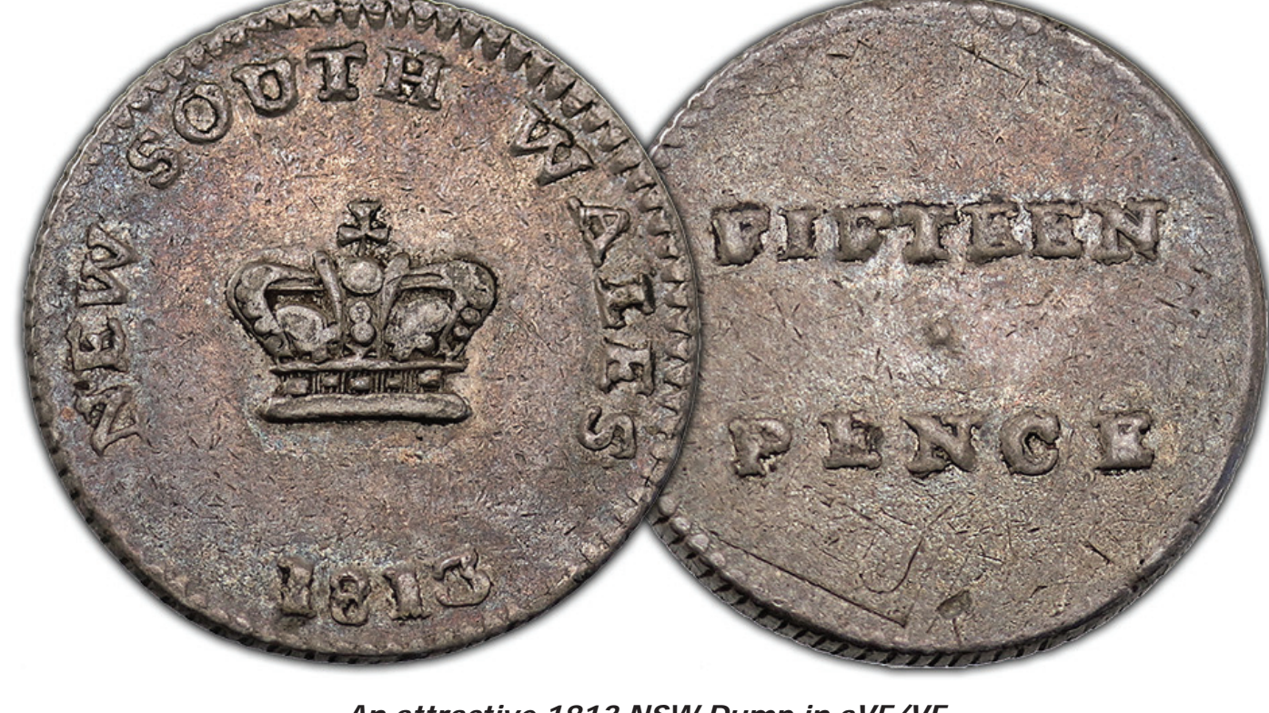
An attractive 1813 NSW Dump in aVF/VF

A superior grade 1930 Penny with most of the band showing six clear pearls and the centre diamond is also sure to be in demand, with this coin perhaps in the top 15 examples of this famous rarity.