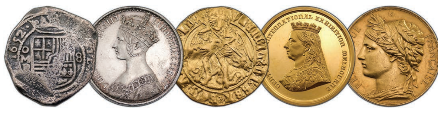
Rare World and British Coins, Medals and Medallions