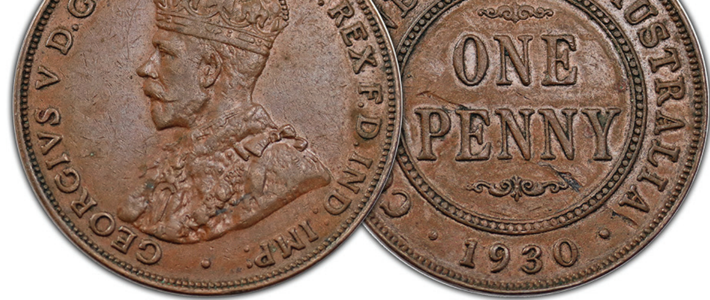
A Superb high grade example of the iconic 1930 Penny in gVF

A key highlight going under the hammer in Sale 99 is a 1920 Kookaburra Halfpenny graded MS 65. Whilst small in size, this superb rarity is set to make a big splash; estimated at $90,000, this is perhaps the finest example known of this very rare issue.