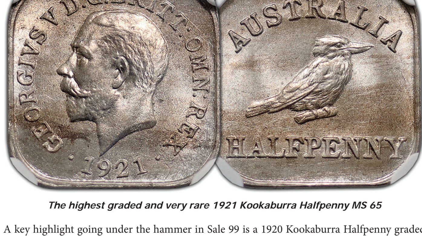
The highest graded and very rare 1921 Kookaburra Halfpenny MS 65

International Auction Galleries' upcoming auction - Signature Sale 99 in March - is set to become another numismatic highlight event! Signature Sale 99 will open for Online bidding from the 20th of February, with the live auction to be held from the 12th to the 14th of March. With a record number of vendors represented in Sale 99 that include one huge estate of over 400kgs of material, and an auction total of 2,280 high quality lots, this auction is packed with rare and collectable items for every numismatic enthusiast. With pre-sale estimates totalling over $1.7 million, Sale 99 is set to be another impressive sale in a strong run of recent auctions for IAG.