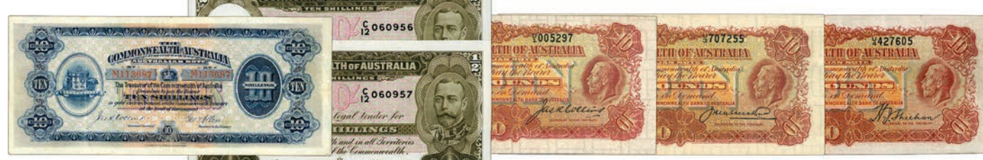
Numerous Pre Decimal banknote key issues