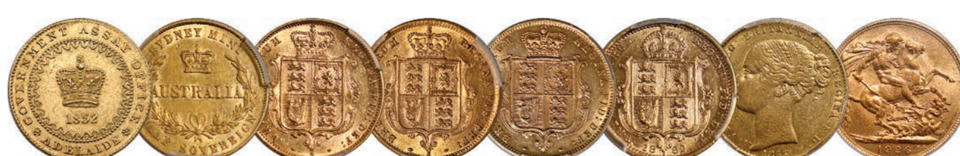
A large selection of Rare and bullion Gold Half Sovereigns, Sovereigns and sets

Of course there is also IAG's usual wide selection of material on offer, including a large selection of gold issues including Half Sovereigns, Sovereigns and modern mint and bullion gold issues, a ranging selection of Pre Decimal coins - many PCGS graded including proofs - as well as Pre Federation issued and Specimen notes, Pre Decimal and a huge selection of Decimal banknotes highlighted by numerous First and Last Prefixes, Special Serial numbered notes, Error notes and Star notes. There is also a nice selection of British coins featuring a popular Gothic Crown, along with a large selection of World Coins and Banknotes, Mis-struck coins, a large selection of RAM and Perth Mint products, RAM rolls, NPA and so much more!