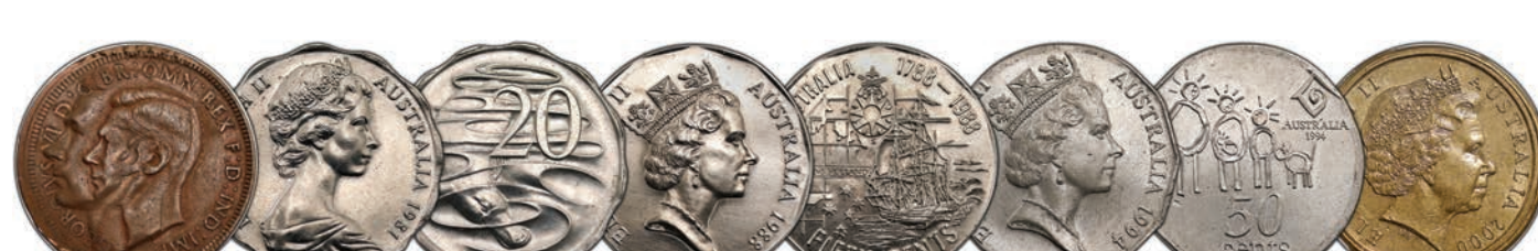
A significant range of rare Pre decimal and Decimal error coins