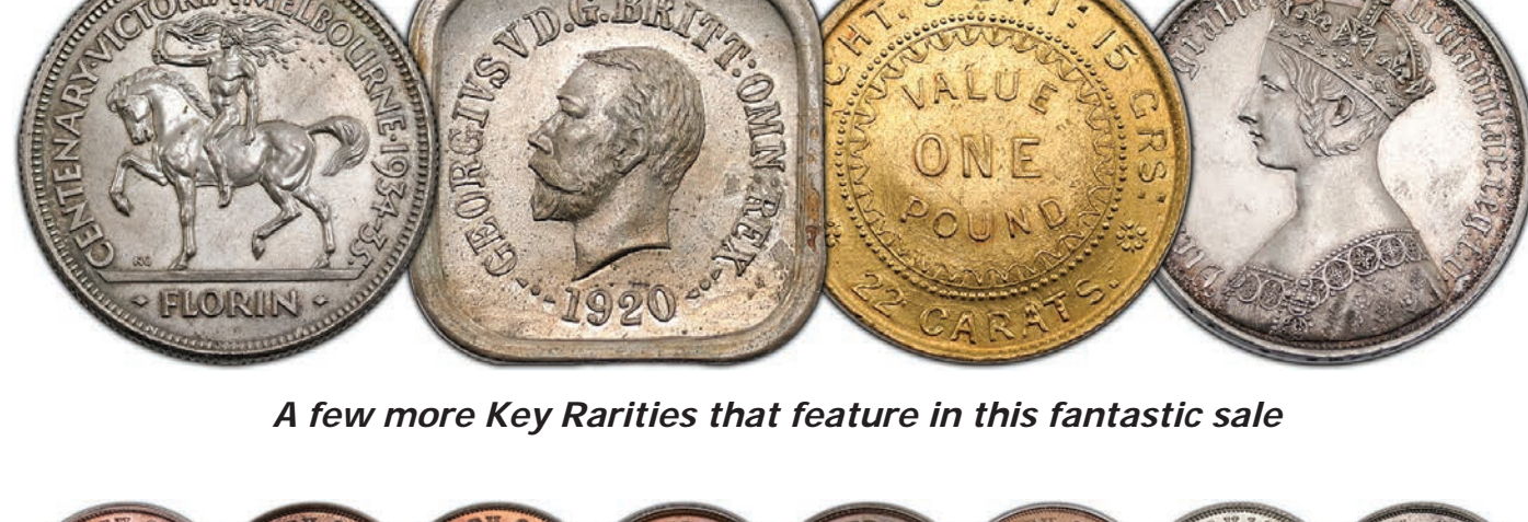
A few more Key Rarities that feature in this fantastic sale

An attractive NSW Dump from 1813 is another highlight, and a feature of a great selection of colonial Proclamation issues. Graded as aVF/VF and estimated at $35,000, this example possesses a lovely light old tone with some original old reverse under-type present from the original host coin and has a strong crown.