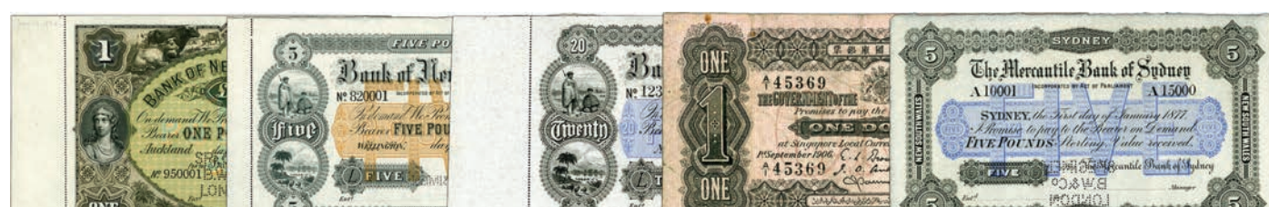
Some interesting and rare World Banknotes